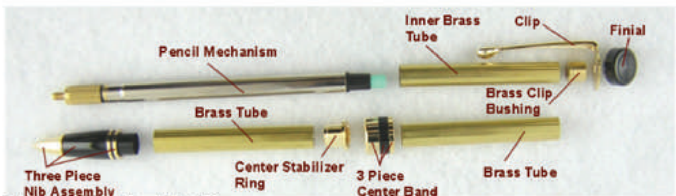
Flat Top American Pencil Parts Diagram